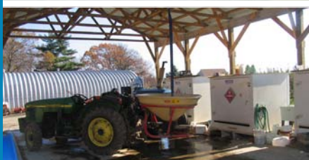
agrichemical handling facilities