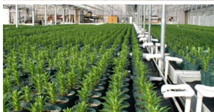
closed irrigation systems

In Massachusetts, there are over 70 different conservation practices eligible for funding through EQIP.