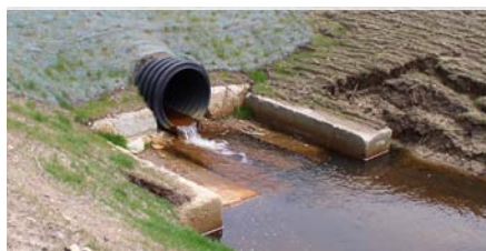
water control structures