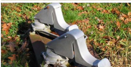
livestock watering systems